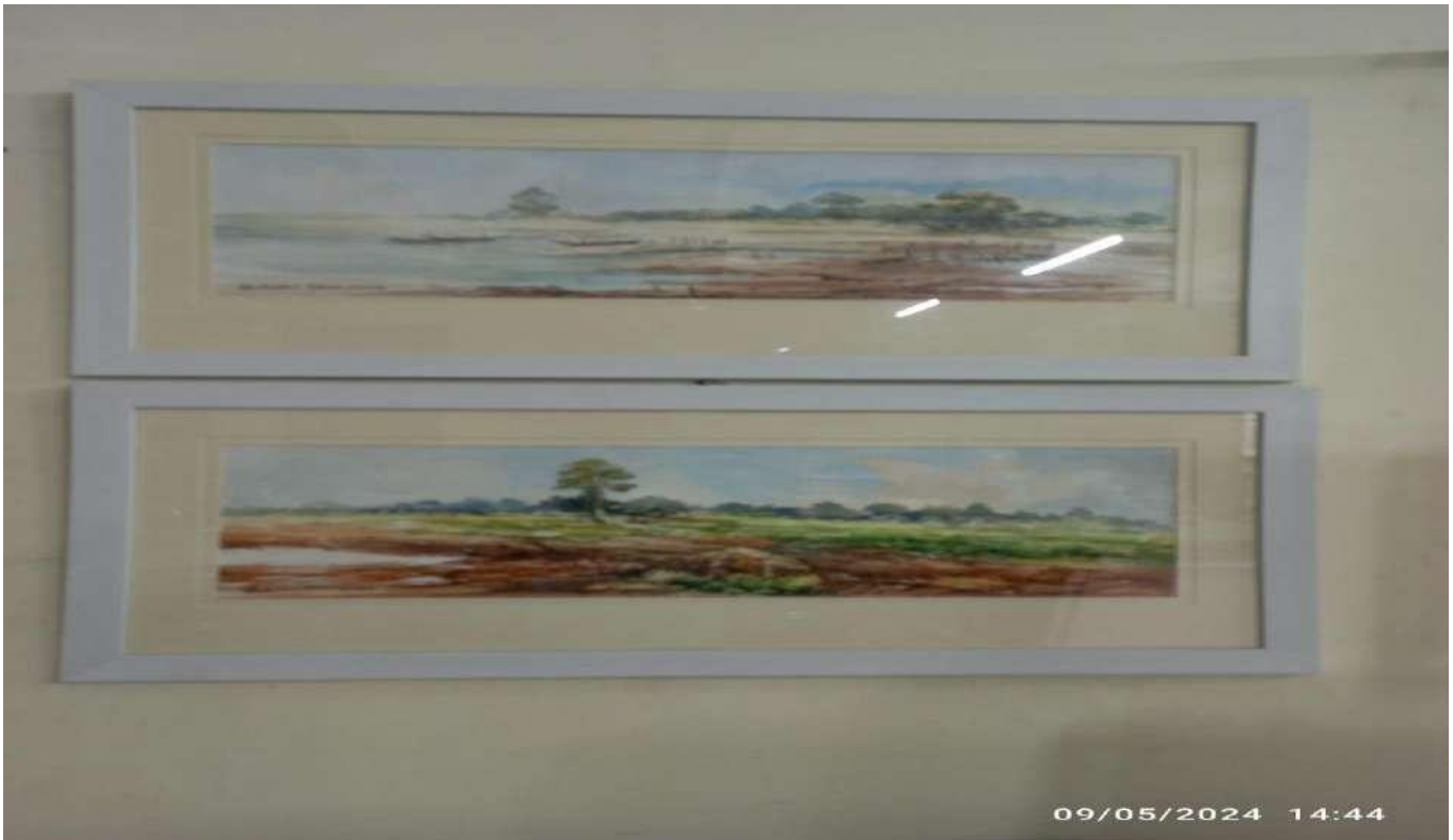
Figure 1: Art Gallery