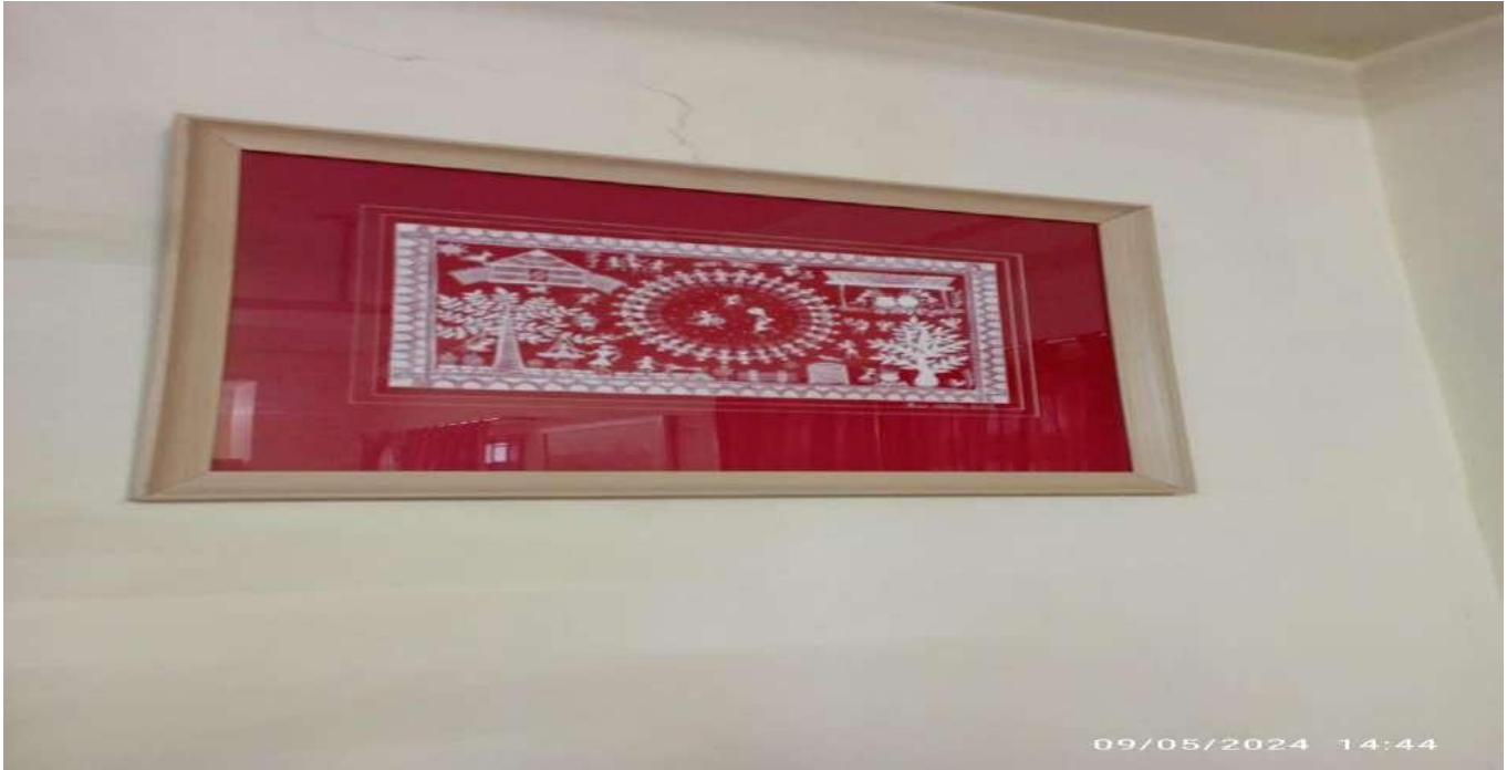
Figure 4: Picture at the Art Gallery