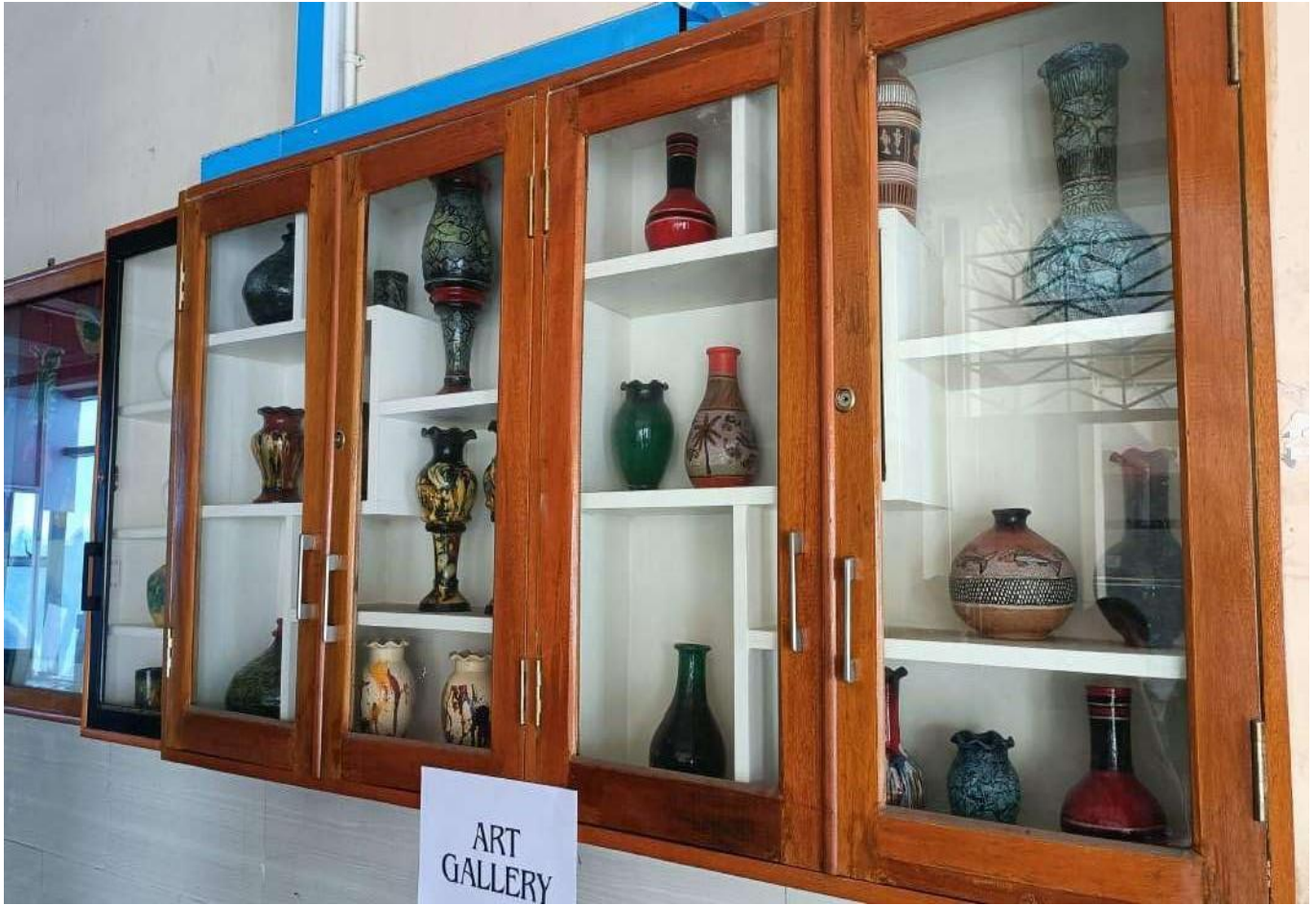
Figure 7: Art Gallery