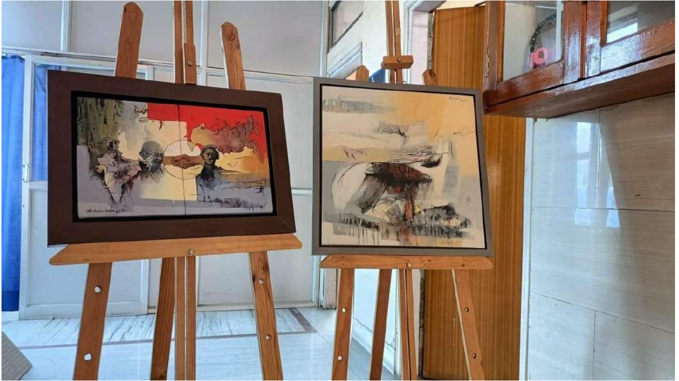
Figure 6: Art Gallery