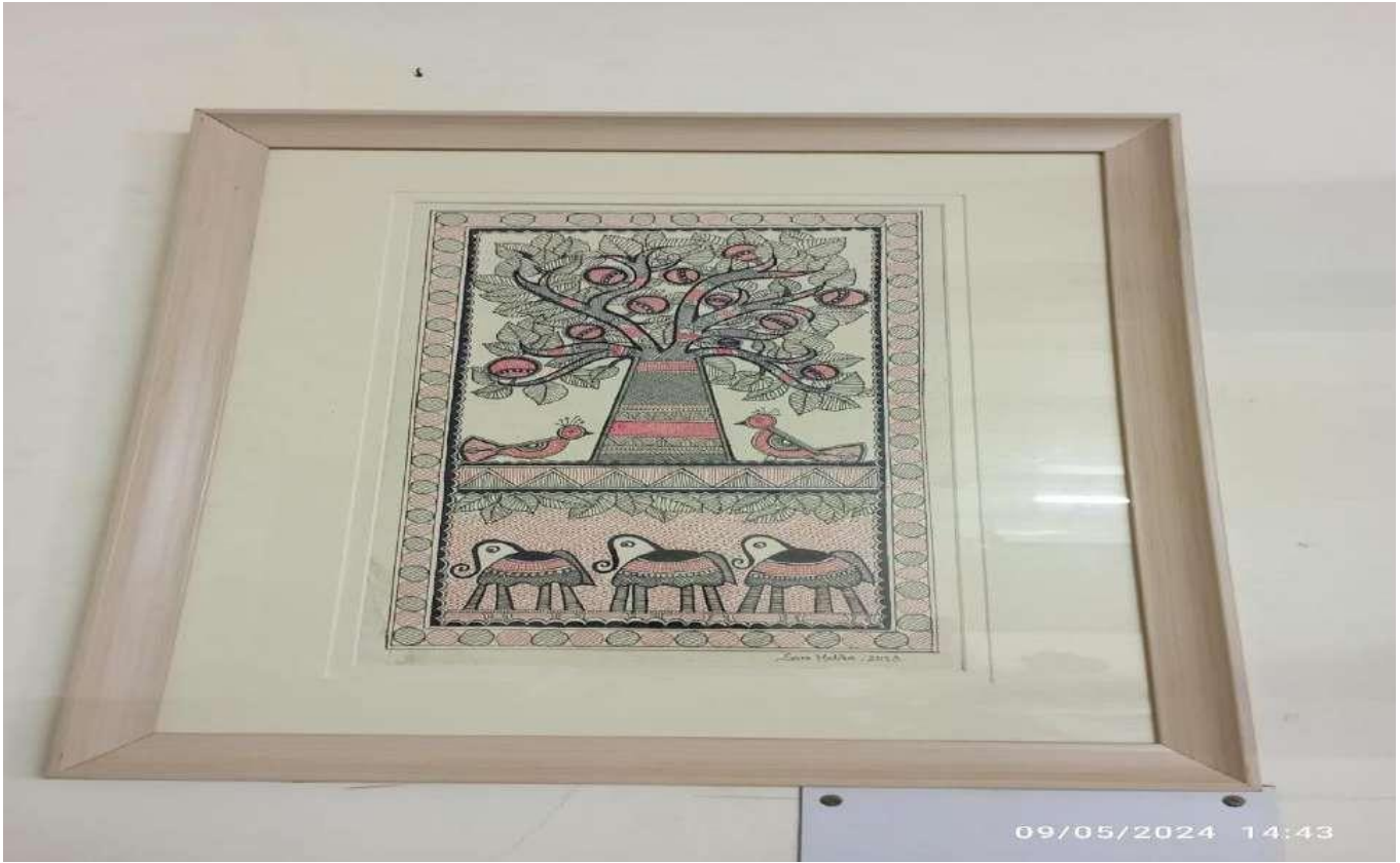
Figure 3: Portrait at the Art Gallery