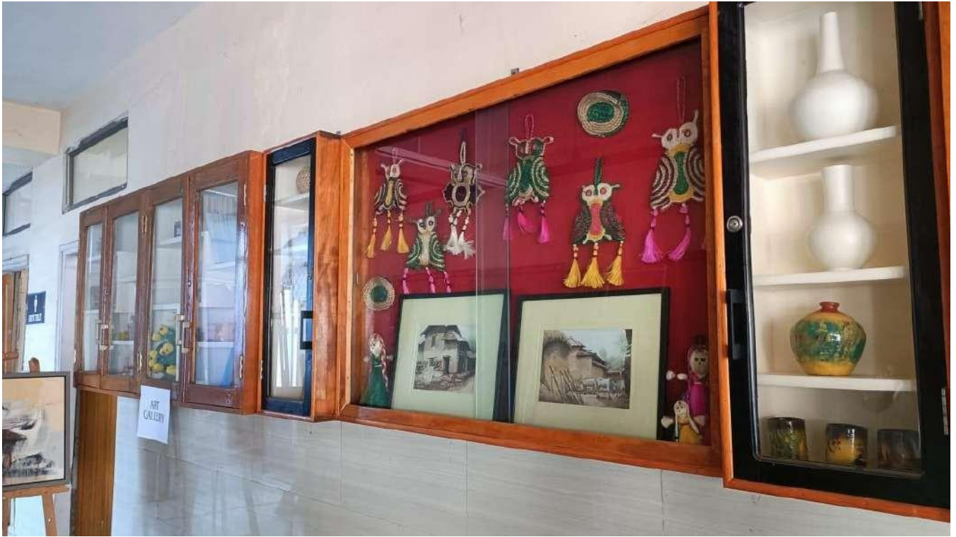
Figure 5: Art Gallery