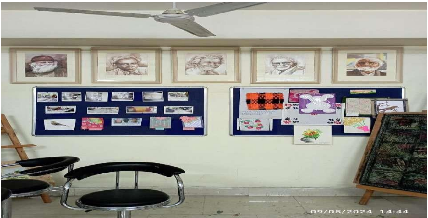
Figure 2: Art Gallery